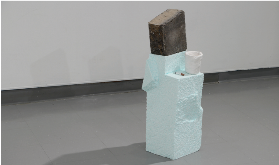
VSVSVS, Drift , installation view at Centre Bang, 2015.