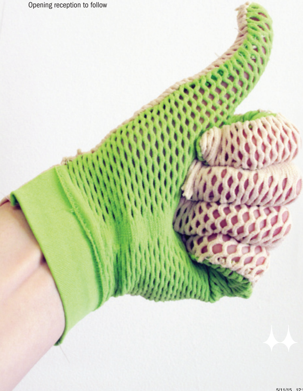
30 May - 25 July 2015 Artist Talk Friday 29 May 2015, 7PM Opening reception to follow